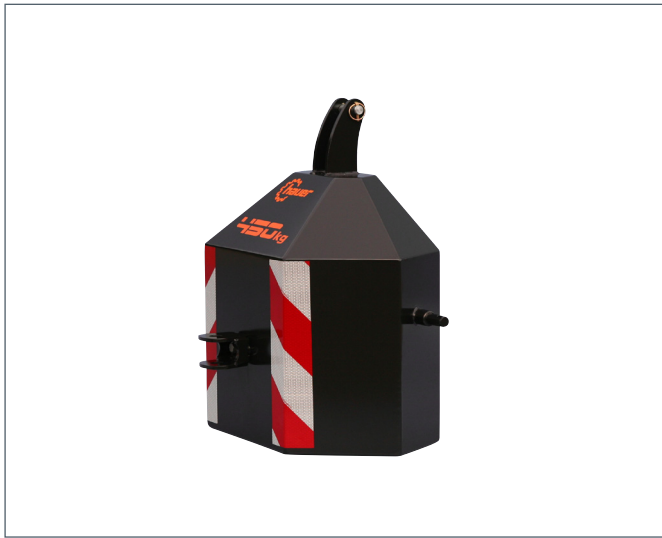
3-point weight 450 kg