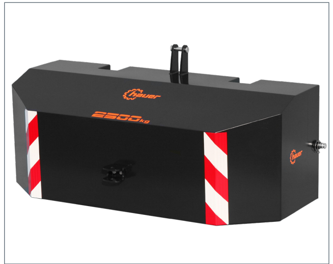
3-point weight 2500 kg